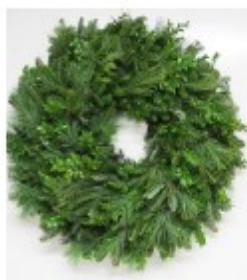
Wreath 24" – $35 30" – $45