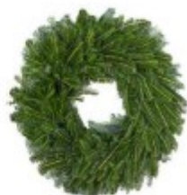
Wreath 24" – $30 30" – $38