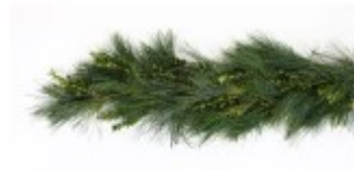
Garland 25ft – $40

Local Delivery Options: available for an additional $10 or FREE on orders over $100! Contact: Mary Kathryn Hulme (803) 225-0209 or Abbye Price (803) 972-1917