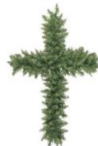
Cross Wreath $45